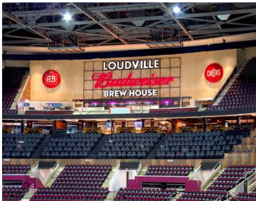
The Budweiser Brew House gives fans in Loudville a premium destination with exceptional views of the court.

Aramark | food service Library Street Collective | art curator