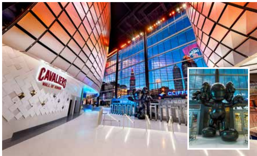
The Cleveland-Cliffs entrance offers spectacular views of downtown Cleveland. The interior features the Cavaliers Wall of Honor flex wall and the "Final Days" sculpture by KAWS.