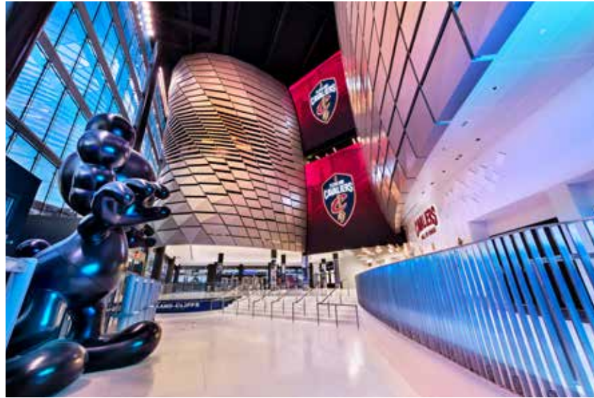
When guests enter through the Cleveland-Cliffs entrance, they're greeted by a stunning visual experience on the Canyon.

"We wanted to elevate the fan experience throughout the building,"