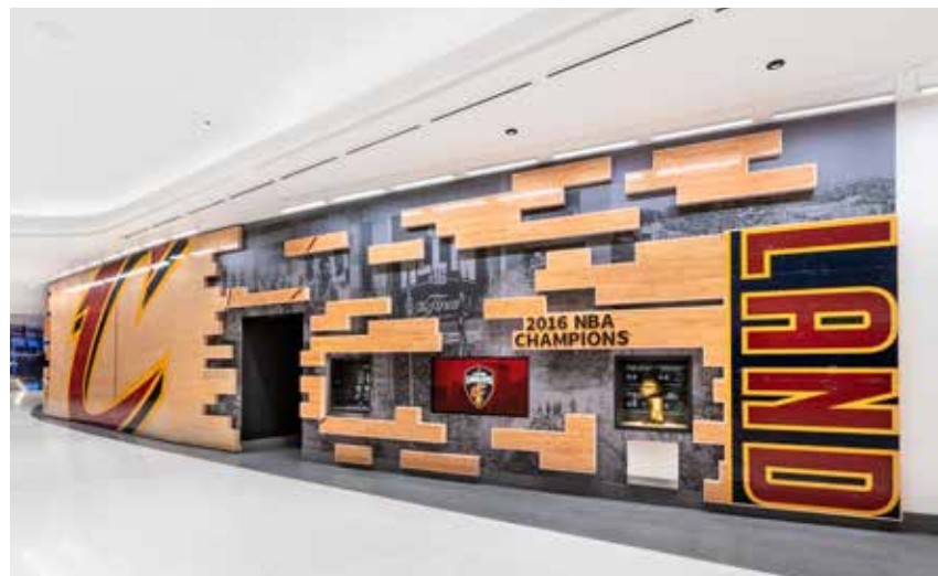
One of the five flex walls in the North Atrium pays homage to the Cavs' 2016 NBA Championship. It features the championship court and replicas of the trophy and ring.

"We've pre-programmed lighting schemes for the curtain wall," said Conley. "We can pre-program event-type templates for every event. It cre-