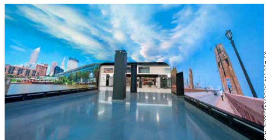
The Power Portal is a fully immersive video and audio tunnel that can be programmed with any visual, including views of downtown Cleveland.