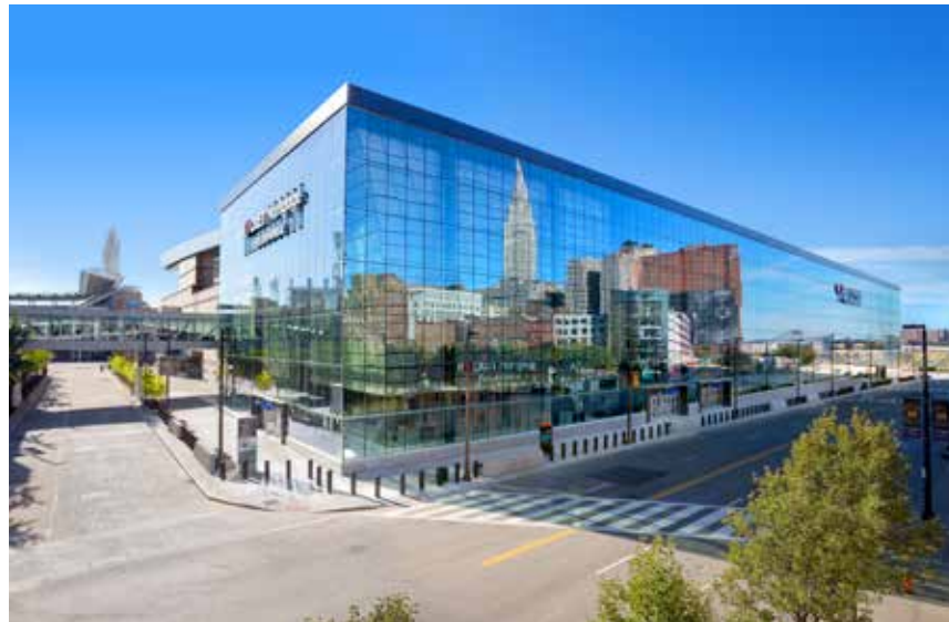
More than 1,475 panes of glass enclose the North Atrium, providing a magnificent reflection of downtown Cleveland.