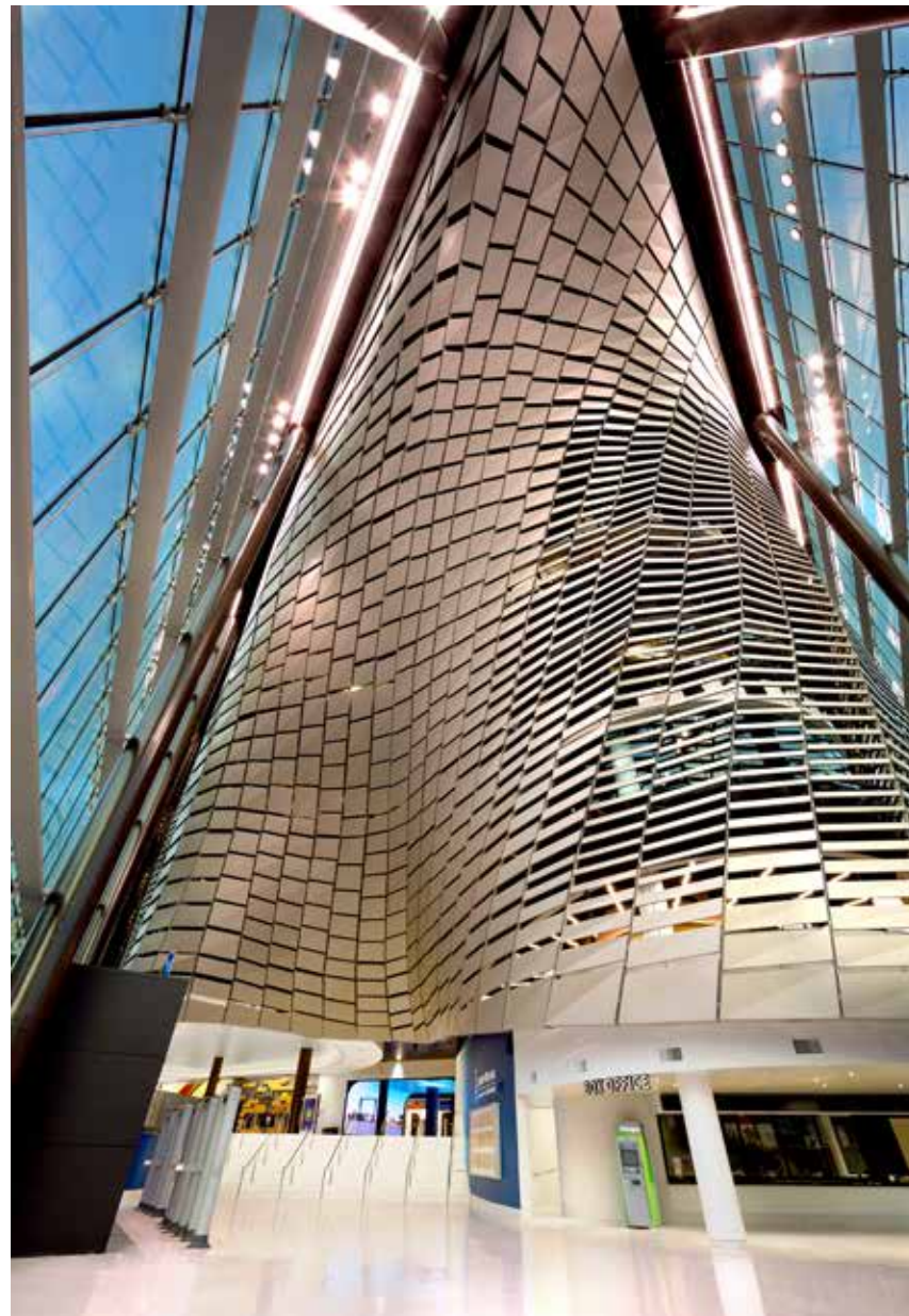
An impressive 77,110-square-foot of brushed aluminum forms a massive winding curtain wall inside the North Atrium.

5 | Creative storytelling multimedia flex walls