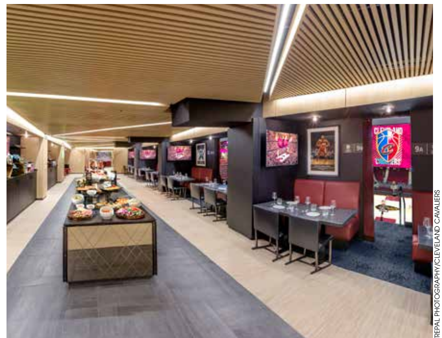
Each box in the Huntington Legends Club features photos of Cleveland's basketball and hockey legends.